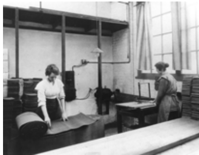
Jeyes Ltd. Corrugated cardboard cutting machine. c1918.