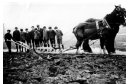
Ploughing in Brompton Park