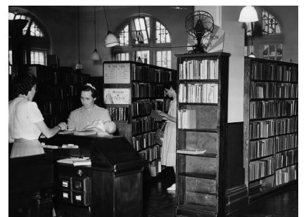
Manor Park Library-interior. 1946.