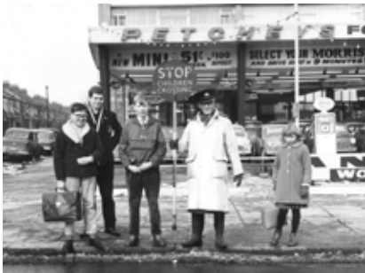
Crossing patrol, Barking Road. 1965.