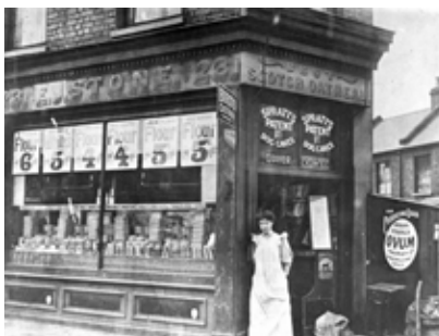
231 Barking Road-c1895