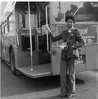
Female bus conductor © Museum of London.